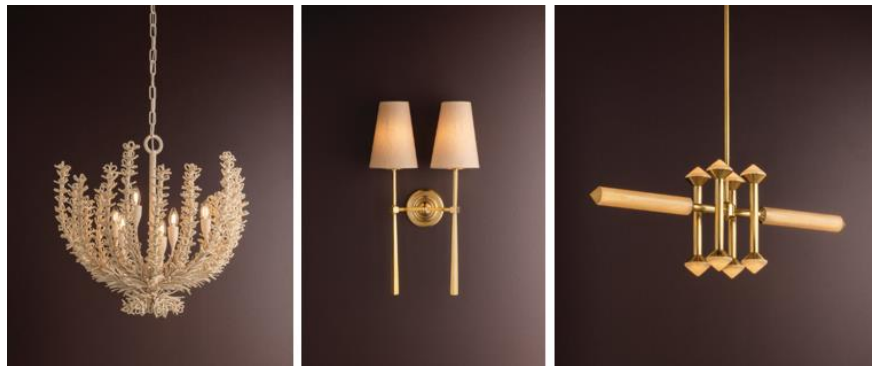
L-R: Pedrillo Chandelier, Cadiz Sconce, Hydra Chandelier

In contrast, Luxe Elemental explores structure, geometry, and materiality through a more architectural lens. From the sweeping, sculptural arms of Frankfurt to the alabaster glow of Lausanne and Augustin, each design emphasizes form and illumination as a unified experience. Statement pieces like Istanbul and Parigi bring a jewelry-like approach to lighting, while designs such as Hydra and Konstanze introduce bold, graphic elements. The result is a collection that feels at once expressive and refined, pushing the boundaries of decorative lighting while maintaining a sense of timeless sophistication.